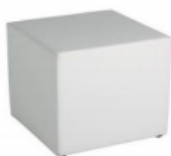
Pomp I blanc