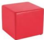
Pomp I red