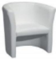
Umbria I blanc