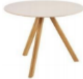
Amagni 50 white