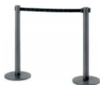
No entry ( 1 potelet + enr. )