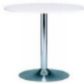
Albaredo 70 80 blanche