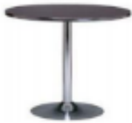
Albaredo 70 80 black