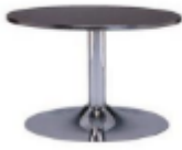
Albaredo 40 80 black